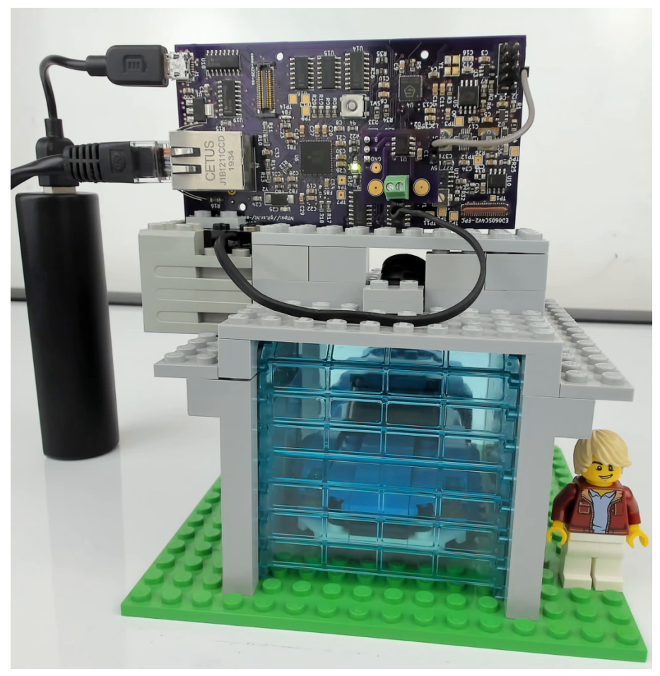
Figure 5-1: Garage. Development board by Jessie Grosen, Adam Suhl, and myself.

system where hardware-description-language execution was defined using traditional semantics, the omnisemantics-based specification of RISC-V makes it easy to specify that the top-level loop of the demonstration program will keep executing: